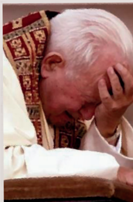
Jesus I Trust In You